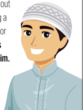
Image from "Organ Donation Decisional Guide for Muslim Americans."

Sharif will take all the information from his doctors and religious leaders, talk with his family, and make the choice about becoming a living donor that feels right to him.